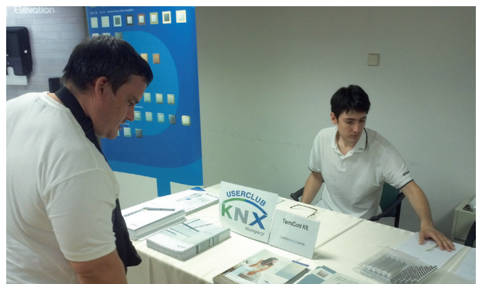
KNX Userclub Hungary informs about Energy Efficiency