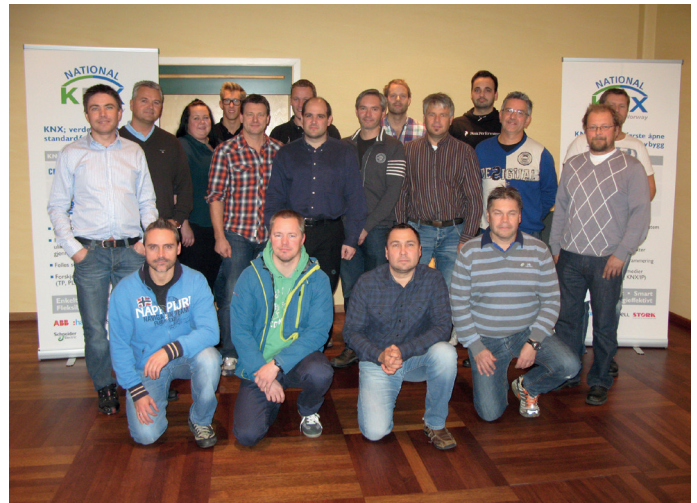
Foundation of KNX Norway

Since KNX has become the worldwide STANDARD (ISO/IEC 14543-3) for home and building control, the use of KNX in products for home and building control has increased considerably. As a result, the KNX Association has extended its presence to more than 120 countries. In order to offer a KNX platform for KNX Partners, users as well as further entities (such as KNX Training Centres, Schools, KNX Members and other associations), the KNX Association has introduced the concept of KNX Userclubs . A KNX Userclub is a neutral, non-profit association grouping the KNX Community in a country or region. The main mission of KNX Userclubs is to spread and to share experience on the KNX technology. This platform is an ideal environment for KNX Partners to meet each other to exchange experience. If desired, a KNX Userclub may be a subgroup to the KNX National Group. The main mission of the KNX National Group is to increase awareness for the KNX technology by performing different marketing activities in a given country.