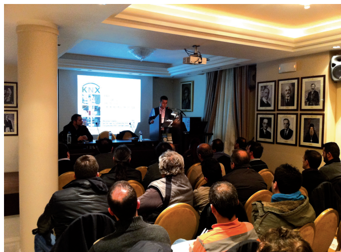
First KNX Seminar in Saloniki, organised by KNX Userclub Greece